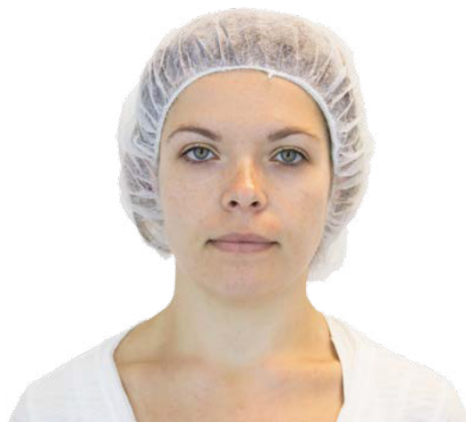
WHITE BOUFFANT CAP